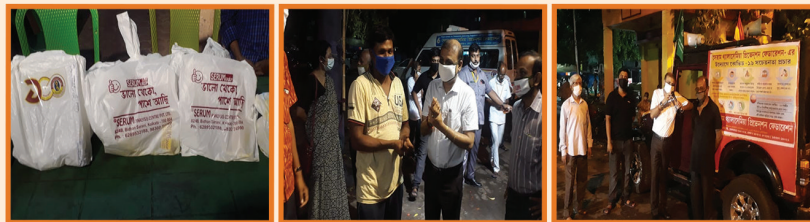
May 22: Block No. 7, Bagbazar & Bagmari Diganta Club