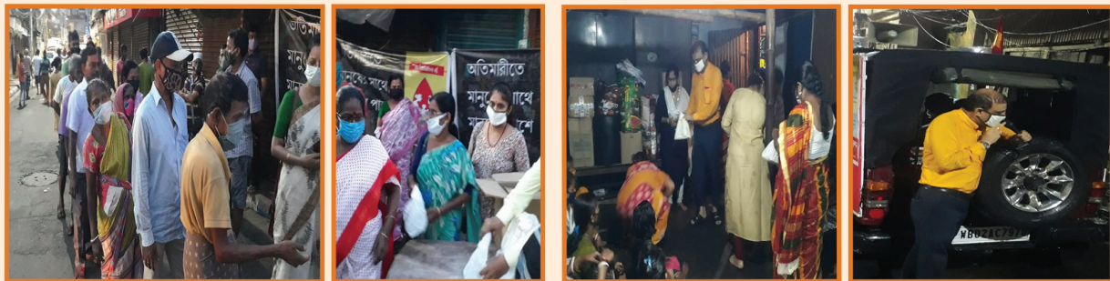
May 28: ULTADANGA Business Association and Bengal National Association