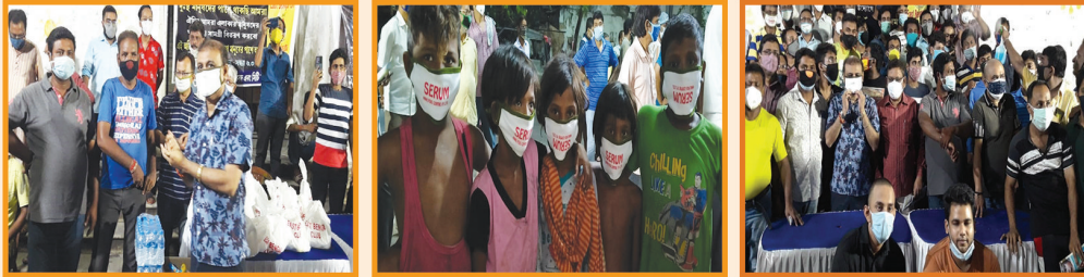
May 29: At City College, Amherst Street

Food Service to People at the time of COVID Lockdown a noble initiative of East Bengal Club & SERUM Group